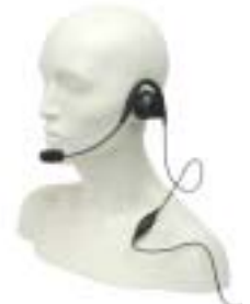
RMN5015 – Heavy Duty Racing Headset (requires RKN4090 Headset Adapter Cable)