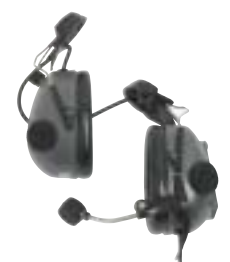
RMN4053 – Hard Hat Mount Headset with Passive Ear Defenders (Grey)