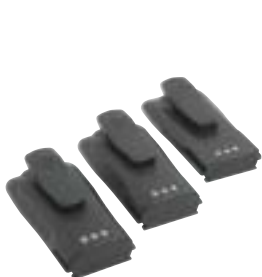
Li Ion, NiCd and NiMH Batteries