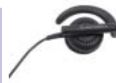
BDN6720 – Flexible Ear Receiver

The choice of management and those working for larger organisations, the CP180 has 64 communication channels for maximum flexibility and an eight character backlit starburst display with ten simple-to-understand icons. The full keypad allows instantaneous one-to-one private line calls or group calls and facilitates access to the menu and contact list that acts like an address book. The user knows who is calling from the 'channel alias' shown on the display. The keypad can be configured to allow immediate speed dial-style access to the most often called individuals and groups. A keypad lock prevents accidental radio knocks making calls and changing settings, thus keeping the user in contact.