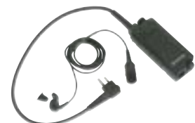
BDN6646 – Voiceducer with PTT and Standard Earpiece